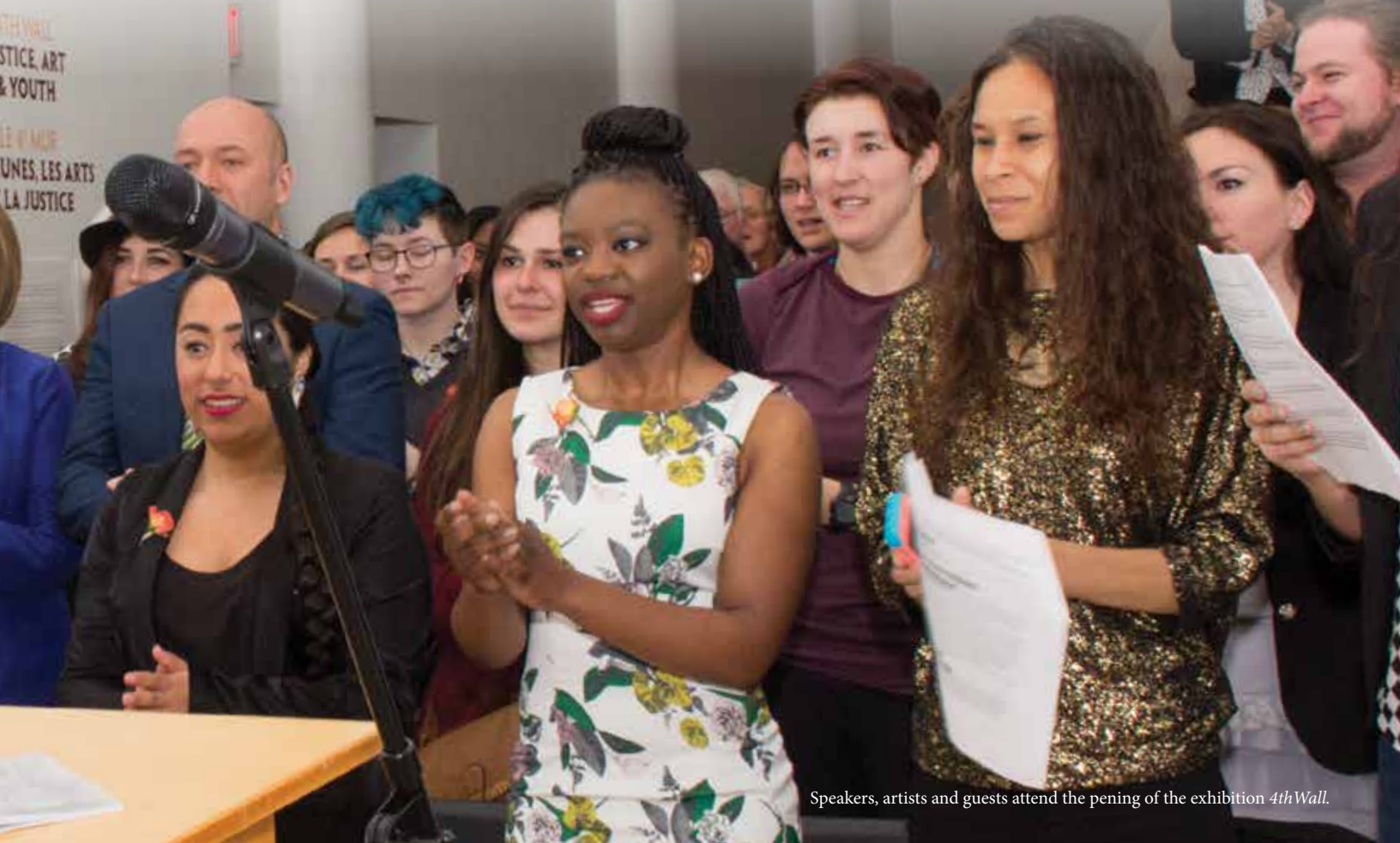
Speakers, artists and guests attend the pening of the exhibition 4thWall.