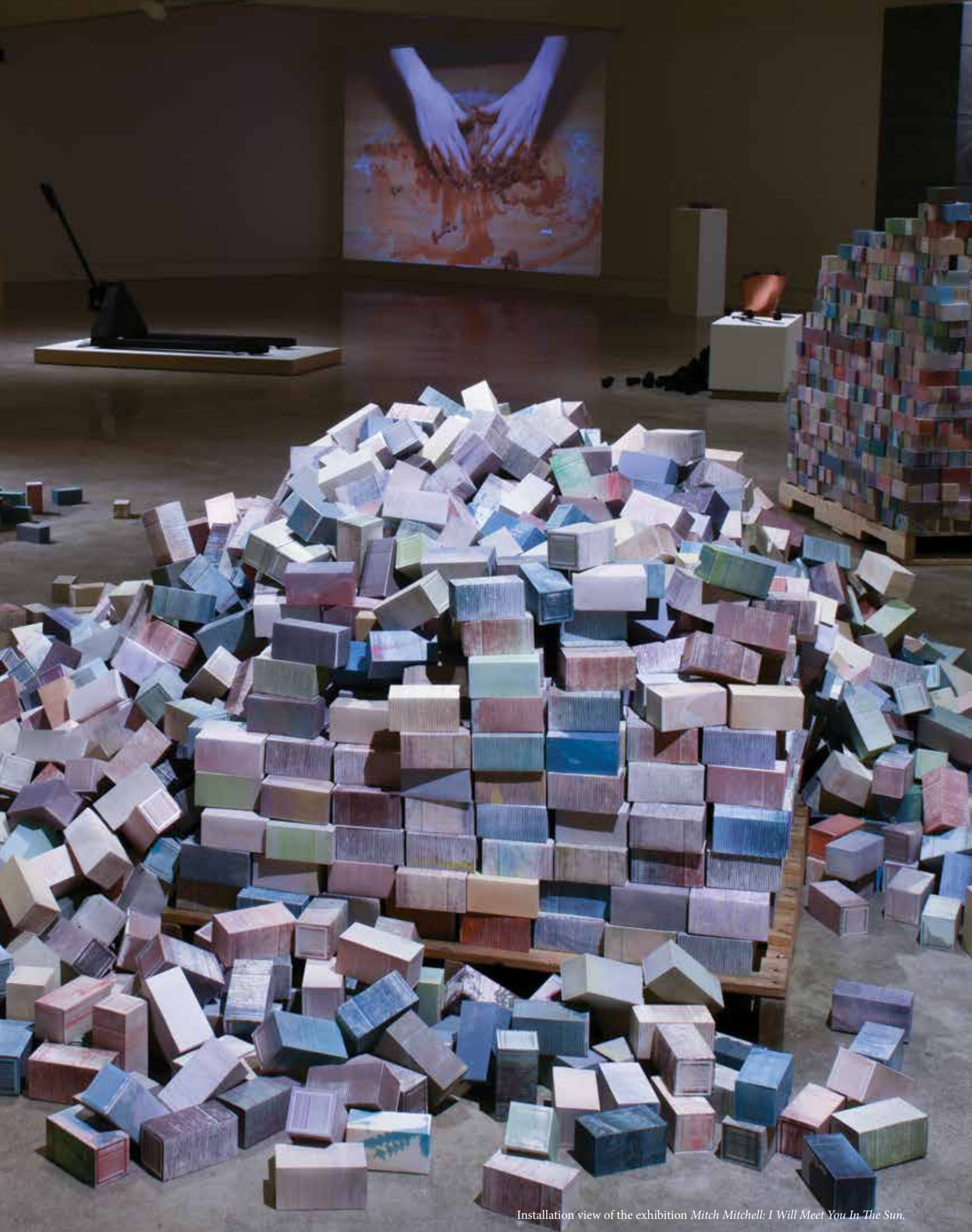
Installation view of the exhibition Mitch Mitchell: I Will Meet You In The Sun.