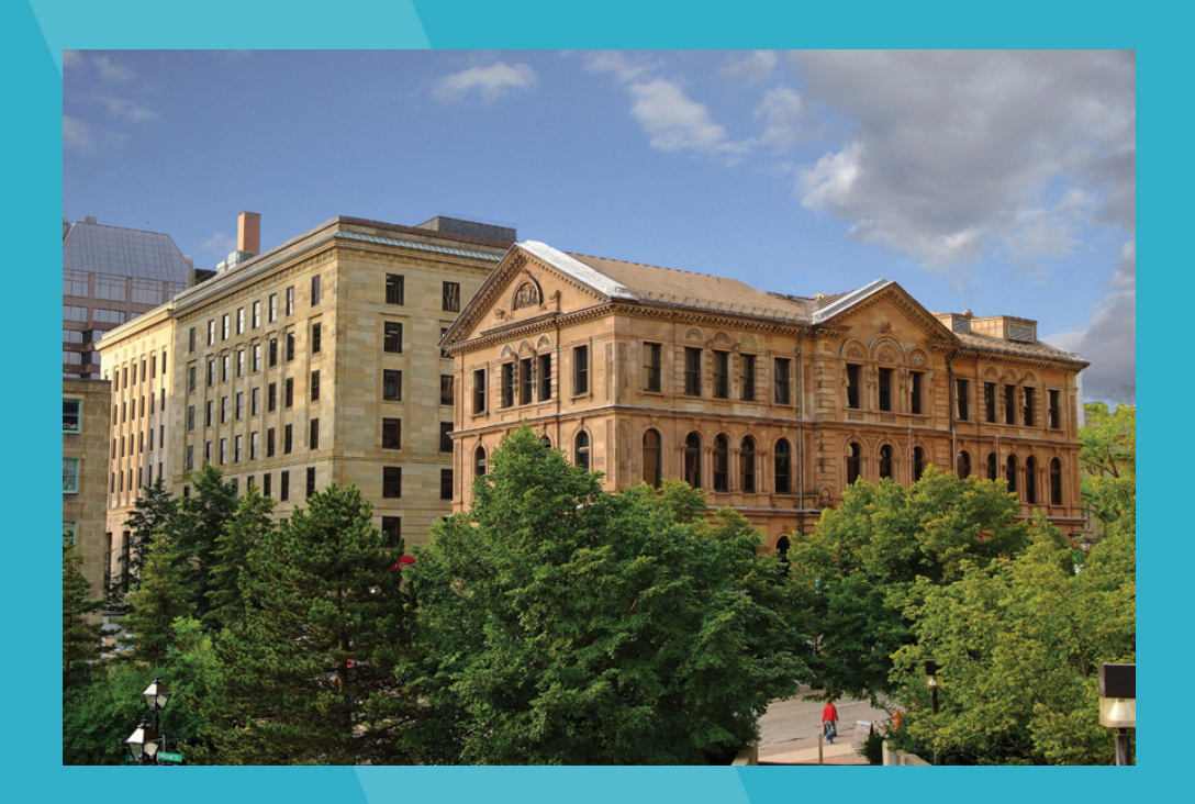
Art Gallery of Nova Scotia, Halifax.