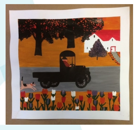
And the painting is complete!

Remove the painter's tape after the artwork is completed and dry.